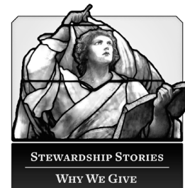
STEWARDSHIP STORIES WHY WE GIVE

Salam City is located on the outskirts of Cairo and contains an estimated 5,000 workshops employing 20,000 children in car-painting, mechanics, carpentry, welding, and other labor-intensive professions. In addition to dangerous work conditions, children in these workshops often face mistreatment by employers. They frequently work longer hours than the legal limit, do not receive promised daily meals, and are sometimes exposed to physical abuse. Very often, these children drop out of school because of their work commitments. Without education, their choices for the future remain limited. Your contributions to BMPC help to support Hands Along the Nile, which works with these children to provide educational, health and protection services.