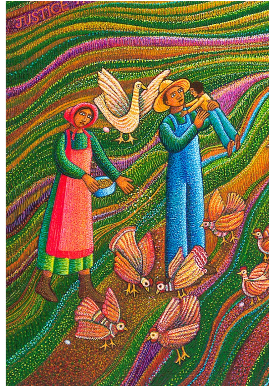
Psalm 85